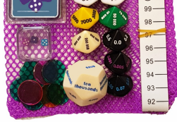
Upper Elem Place Value