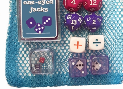
Upper Elem Operations