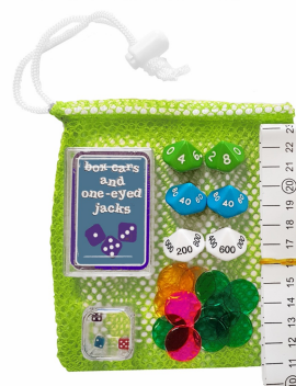
Primary Place Value